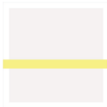
Full Page 7.5" x 7.5" Full Bleed 8.75" x 8.75"